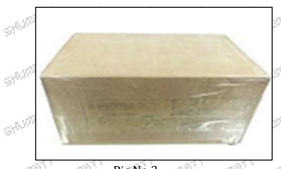
Pic No.2 Domestic express packaging: Wrapped by Transparent tape

Minors are prohibited from using transparent tape, yellow tape, black wrapping protective film, and white wrapping protective film to avoid personal injury.