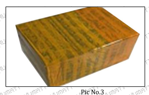
International express packaging: Wrapped with yellow tape after wrapping black protective film